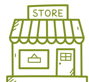
Close to Shops & Stores