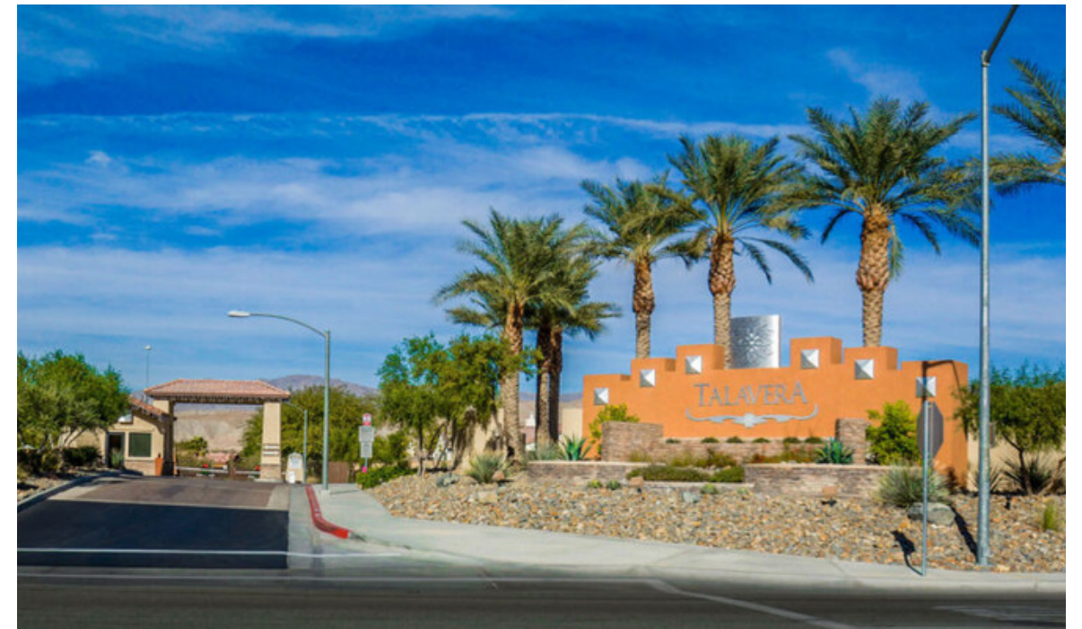
Green Parks & Picnic Areas

The main gate of Talavera is located on Avenue 38 and Jefferson Street in North Indio , California with easy access to the entire Desert via the Interstate 10 Freeway.