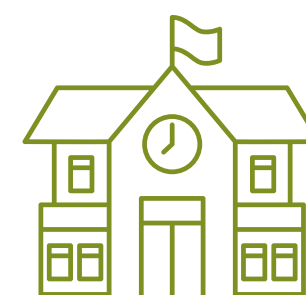
Close to Schools